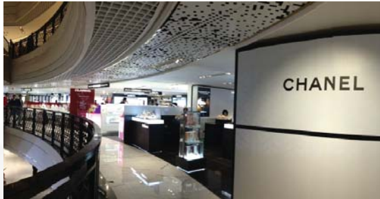
Sogo Department Store